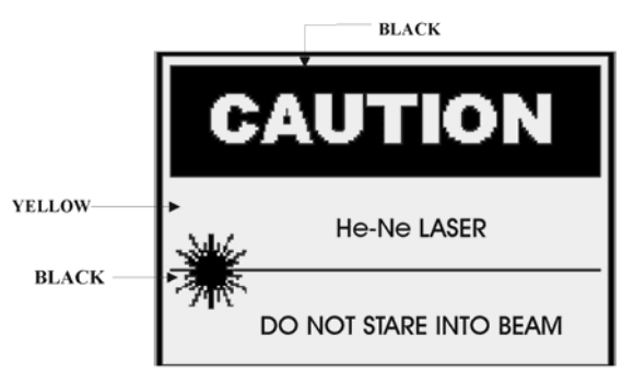
Example of label for Class II and Class IIIa LASER