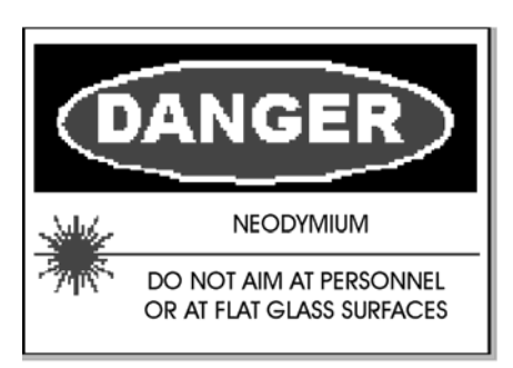
Example of label for Class IIIb and Class IV LASER DEVICES.

Laser safety-warning signs for posting at laser facilities and at laser ranges are stocked at the Naval Inventory Control Point, Naval Publication and Forms Branch, 700 Robbins Ave., Philadelphia, PA 19111-5098. For Information concerning these forms contact: commercial (215)(697-2626), or DSN (442-2626). Order on MILSTRIP via Defense Automated Addressing Systems. The following signs are available: